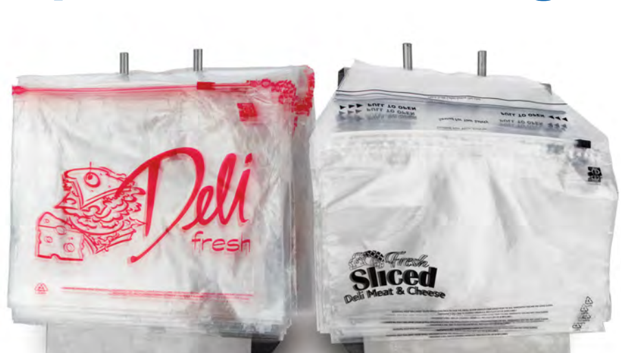
SZTL- DELIFRESH is covered under U.S. Patent No. 7,134,788, & No. 7,044,639 and other Patents Pending